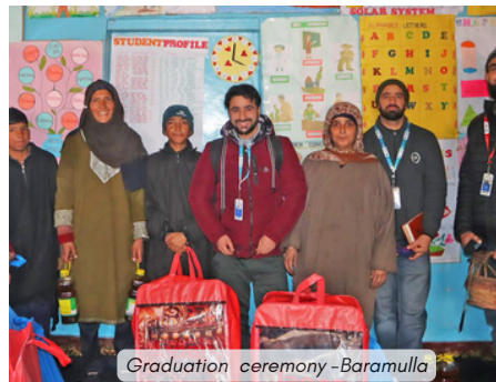
Graduation ceremony - Baramulla