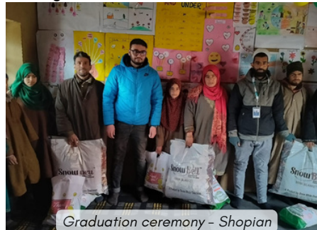
Graduation ceremony - Shopian

As part of the graduation ceremonies, each family received a sustenance kit containing essential items such as blankets and food supplies to support them during this transition. The families expressed their gratitude to CHINAR for standing by them during challenging times and helping them regain their footing.