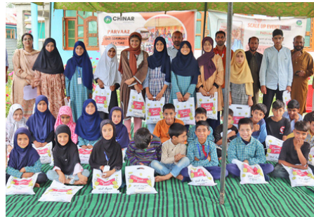
Launch of new community - Harinara, Baramulla