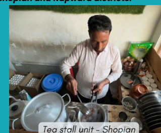
Tea stall unit - Shopian