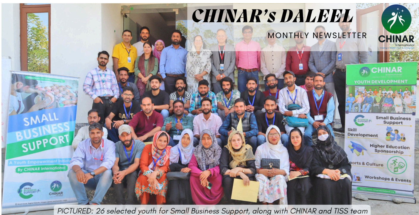
PICTURED: 26 selected youth for Small Business Support, along with CHINAR and TISS team