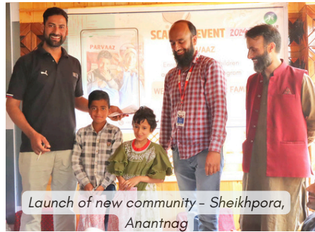
Launch of new community - Sheikhpura, Anantnag

As part ongoing scale up, two new communities have been enrolled successfully – Harinara in Baramulla and Shangus Sheikhpura in Anantnag. At the launch event, 80 children from 36 families were welcomed into the program, with 49 children from Harinara and 31 from Sheikhpura. With the inclusion of Anantnag, Parvaaz has now expanded into a new district.