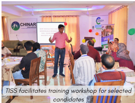
TISS facilitates training workshop for selected candidates

CHINAR International launched the phase 5 of the Small Business Support (SBS) program in a 3-day event with Tata Institute of Social Sciences (TISS) as knowledge partners at Srinagar. The goal of the program is to support business ideas of marginalized youth, enabling them to achieve financial independence. Out of 560 applicants, 45 candidates were shortlisted after a rigorous 4-tier selection process, who presented their ideas to a panel of experts.